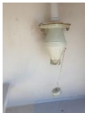
CH 2 S/S AFT