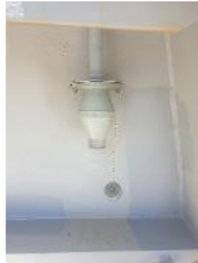
CH 4 S/S FWD