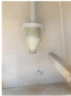
CH 1 S/S FWD