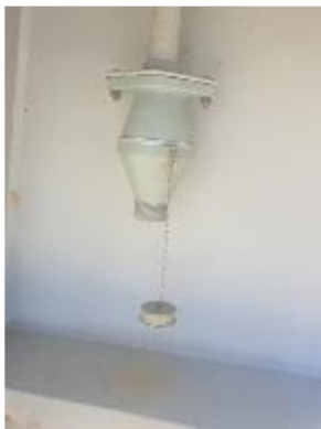
CH 4 P/S FWD