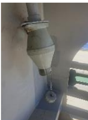
CH 4 S/S AFT