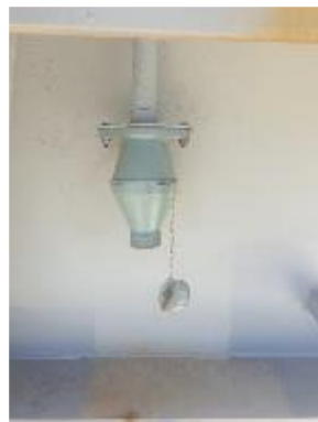
CH 5 P/S FWD