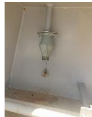
CH 3 P/S FWD