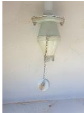
CH 5 S/S AFT