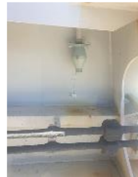
CH 3 S/S AFT