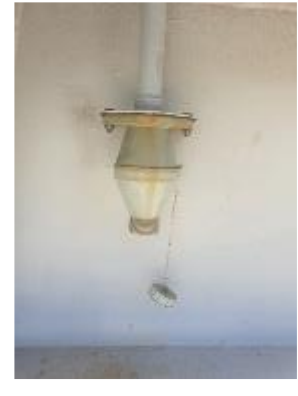
CH 1 P/S AFT