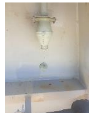
CH 2 S/S FWD