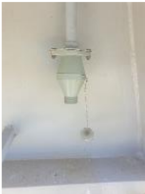
CH 1 P/S FWD