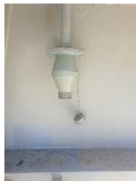
CH 2 P/S FWD