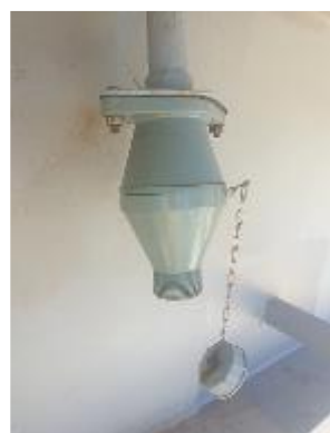
CH 5 S/S FWD