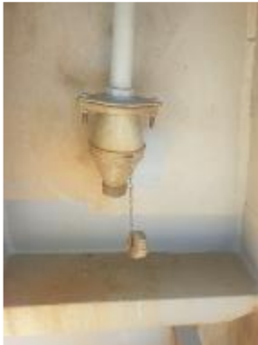
CH 3 S/S FWD

Form: 5.2.1D Page: Page 2 of 3 Date: 07 June 2018 Rev No. 1.2 Appr: BMM