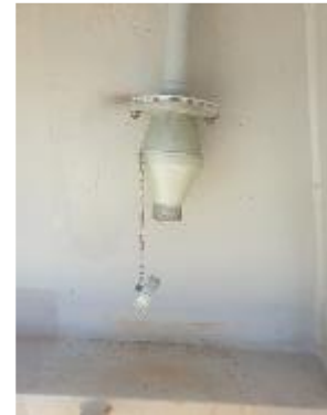
CH 4 P/S AFT