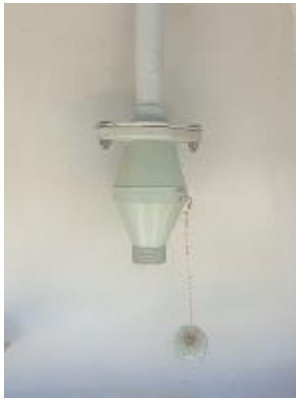
CH 5 P/S AFT

Form: 5.2.1D Page: Page 3 of 3 Date: 07 June 2018 Rev No. 1.2 Appr: BMM