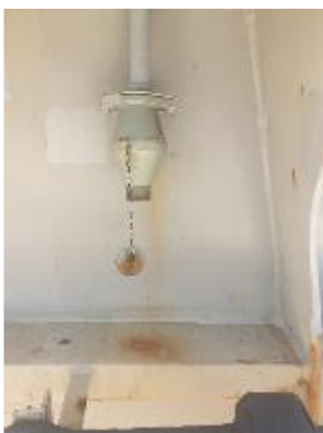
CH 2 P/S AFT