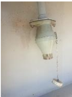
CH 1 S/S AFT