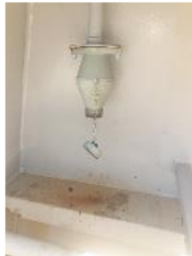
CH 3 P/S AFT